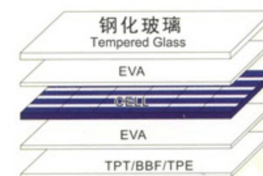
FIGURE OF STRUCTURE